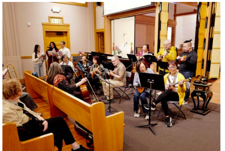
SBUB and Singers.

Please note the flyer information for the upcoming BCA Music Committee Partner Dance webinar on Saturday, May 16 at 11 am. Register to learn the history and dance steps from the Stockton and Cortez dance instructors, organized by the Bon Odori Taiko subcommittee.