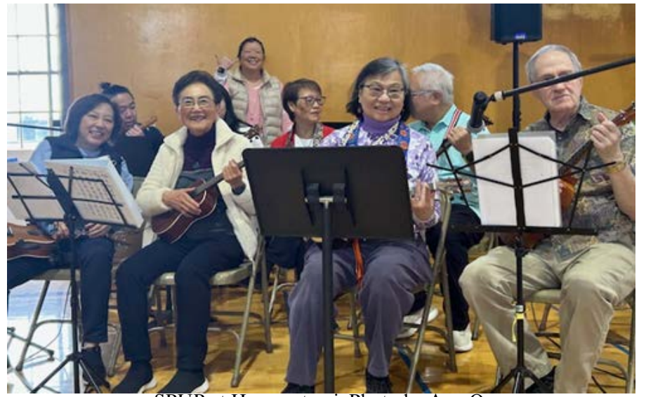
SBUB at Hanamatsuri.