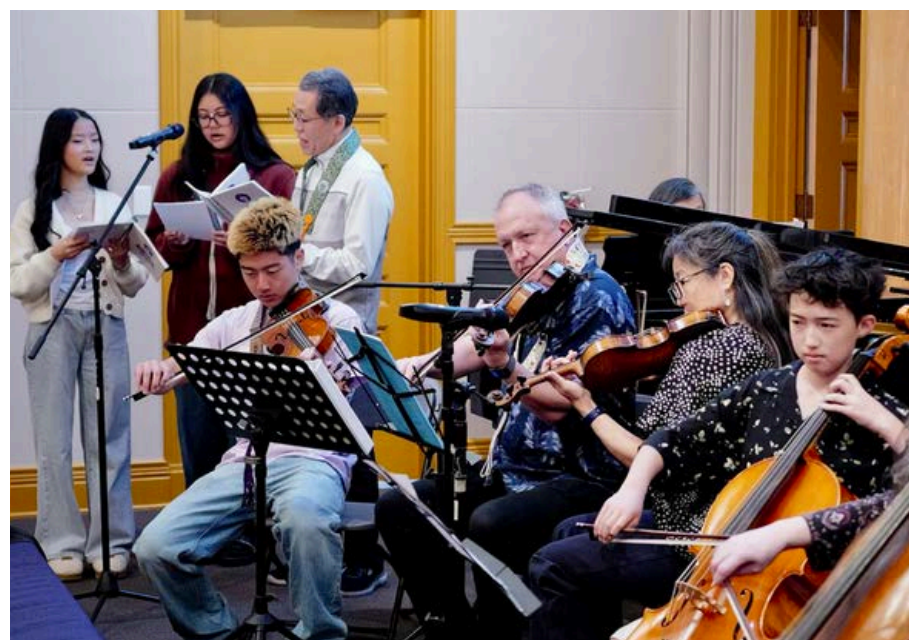
Singers and Bodhi Ensemble.

The next “Singing, Strumming, and Sharing” Zoom will be on Monday, May 11, the second Monday of the month at 7 pm. Please contact the temple office if you wish to be added to the email for the updated Zoom link. In-person ukulele practice this month will be on Sundays May 19 and May 31 at 9:15 am. We are welcome anyone interested in learning ukulele or with musical talents to support future service and Seattle Betsuin 125 th anniversary music.