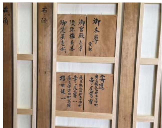
Dedication Plaque on back of Seattle Betsuin Gokūden listing donors