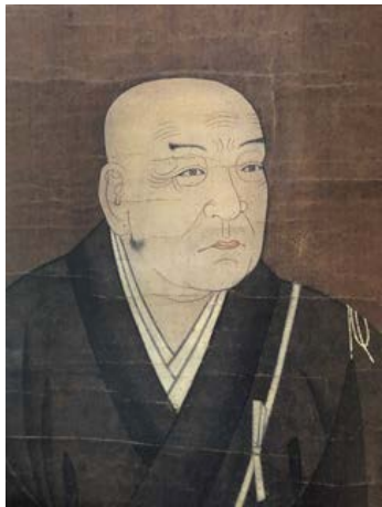
Rennyō Shōnin 1415-1499

Photo from: https://senshintemple.org/teachings/white-ashes/