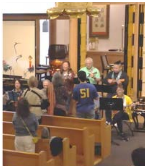
Seattle Betsuin ukulele band accompanying "Amida's Golden Chain of Love" for Earth Day Music Service