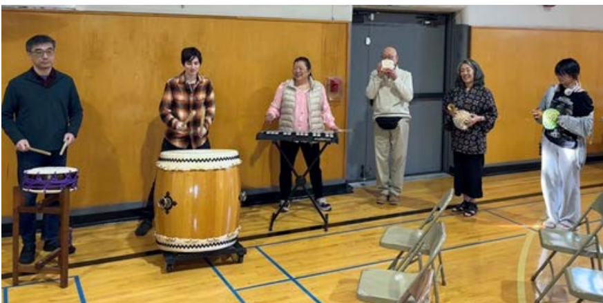
Opening music by Matsuri Service.