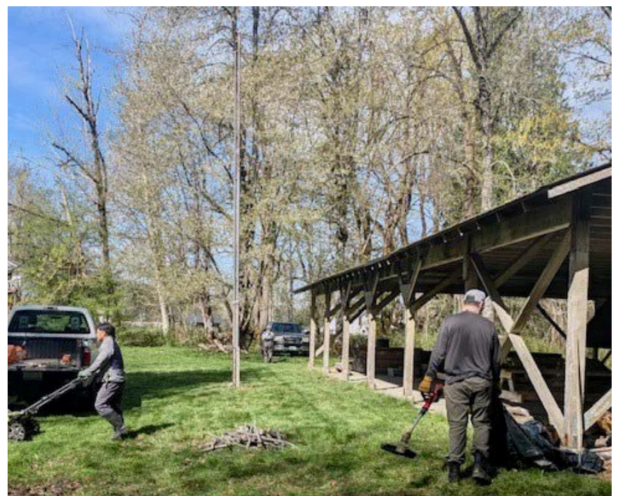
April 18 work party at the temple's property in North Bend