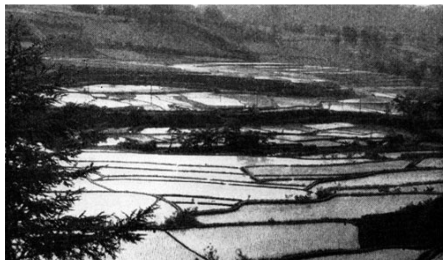
Photograph of Japanese rice fields, circa 1940s.

—★— We went back to our mother’s house in Asa-gun (or Hagiwara) in Hiroshima. My father, sister, and mother were living together. When we moved back, my sister moved out. So, we took care of my mother. They had a farm. We continued to do the farming. My father started farming again, raising rice and wheat. So, we had enough rice. On the planting rice, there was a mandatory. You had to grow how much, then you had to donate to the government. We had enough to give to the government.