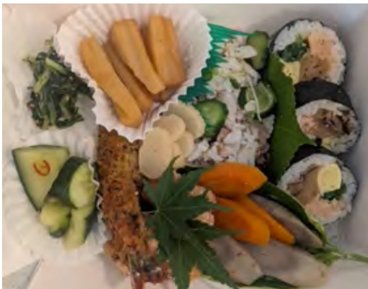
Sunday bento box