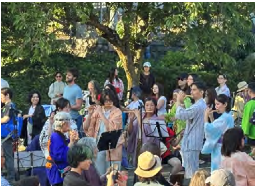
Northwest Minyo Kai woodwind players