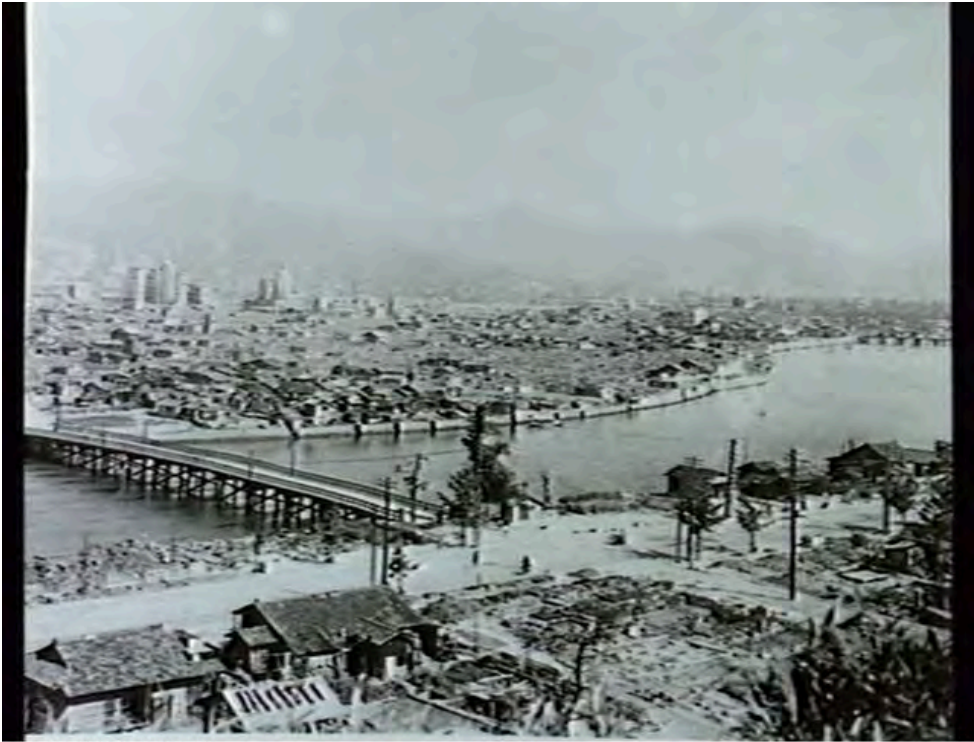
View of Ota river, Hiroshima after the atomic bombing.

It should never happen again. It is my message I would like to leave for my sons and younger people.