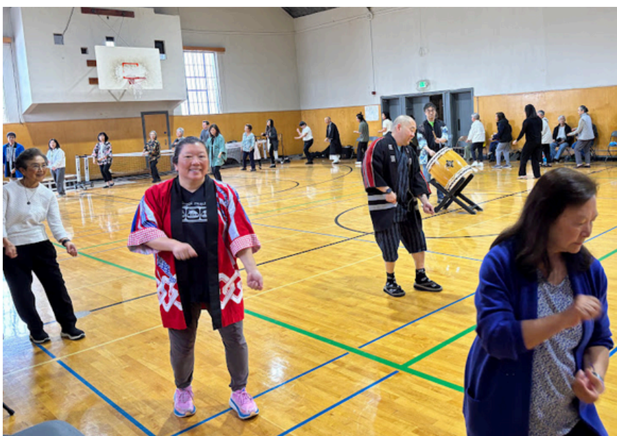
Bon Odori practice “Tanko Bushi” June 22, 2025

https://www.buddhistchurchesofamerica.org/music