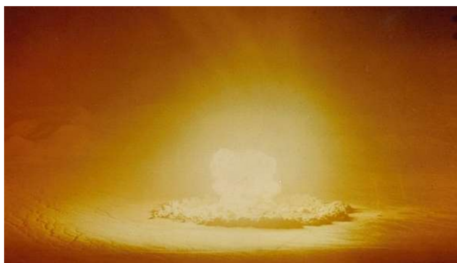
Photograph of a nuclear explosion on Nevada Test Site, 1957.