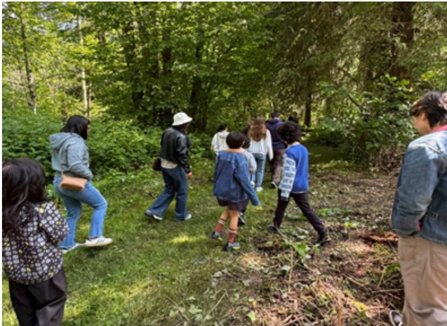
Dharma School year end party fun at North Bend