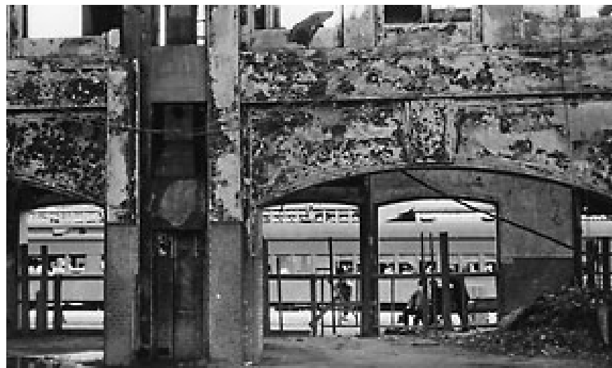
Inside the Hiroshima Train Station after the atomic bomb. https://hpmuseum.jp/virtual/VirtualMuseum_e/exhibit_e/exh0802_e/exh080202_e.html