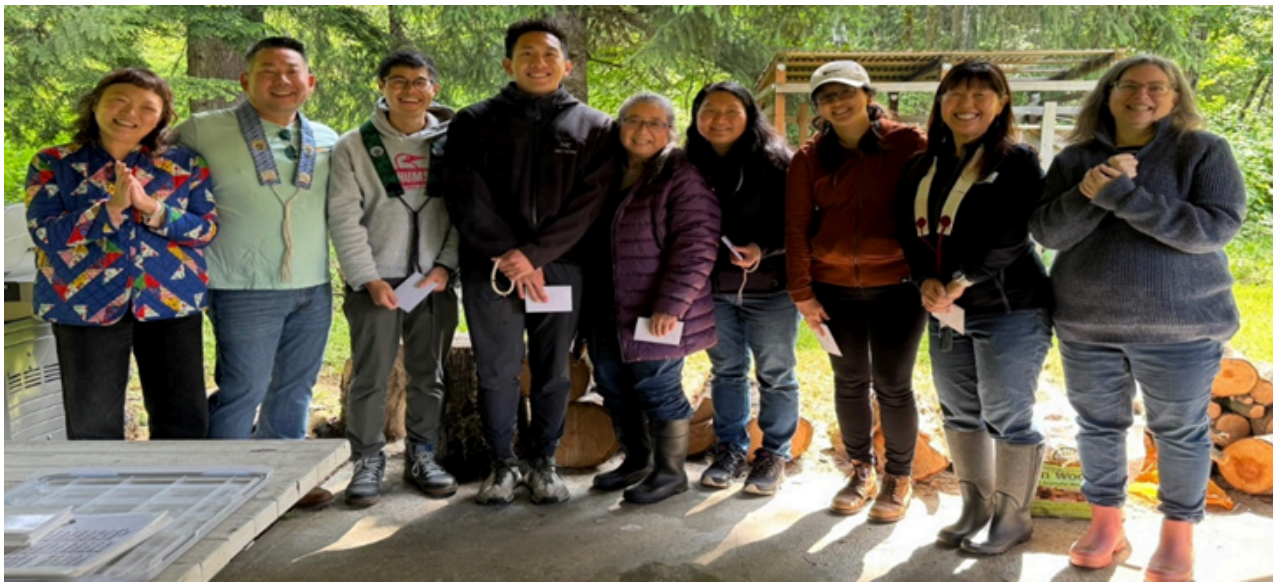
Thank you, Dharma School teachers!