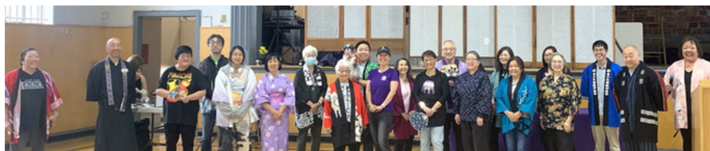
Ready Set Go!

It's the final countdown until Obon 2025 and were treated to a very fun and informative Dharma Exchange on June 22 nd : Ready, Set Go! It was nice to reflect on the meaning of songs related to Jodo Shinshu teachings, and of all the people that come together to make Obon happen. So please invite your family, friends and community to this very fun and meaningful cultural event. If you're able, please sign up to help and consider staying a little extra on Sunday evening to help us dismantle the festival so temple construction can resume the following day.