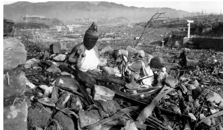
Nagasaki, Japan, After the bombing.

In August 1945, we evacuated to the house of a famous athlete, Mikio Oda, because the armory itself might be attacked by the enemy. We used the second floor of his house as the office of the army armory. I was involved in office work there. At 8:15am on Aug 6, I just came out of the entrance of the house with my friends. A strong orange light struck our eyes. We were very surprised and ran into the house again. Unfortunately, the house collapsed, and we were buried under the house. The bomb blast smashed the