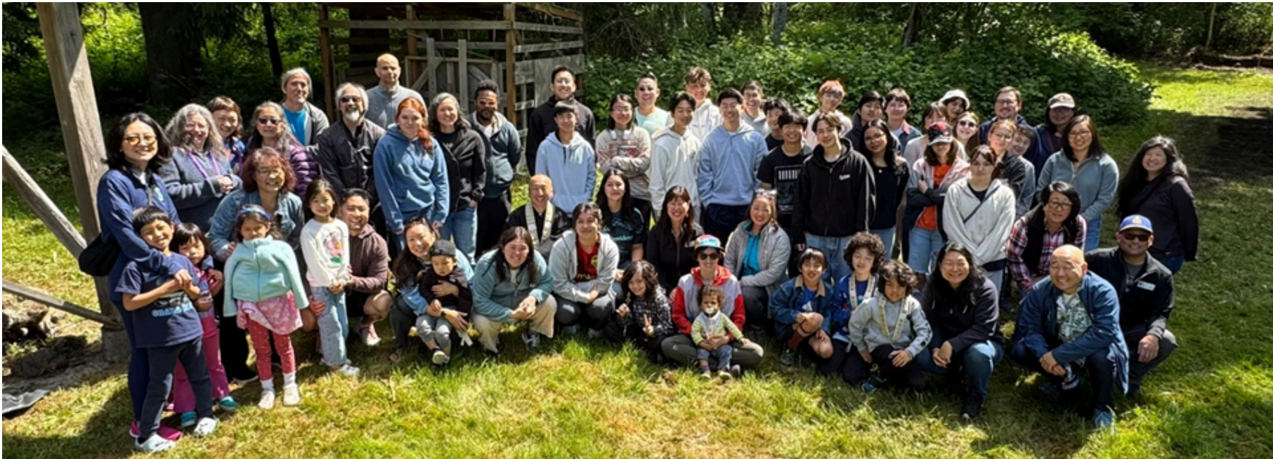
Thank you, Dharma School students and families!