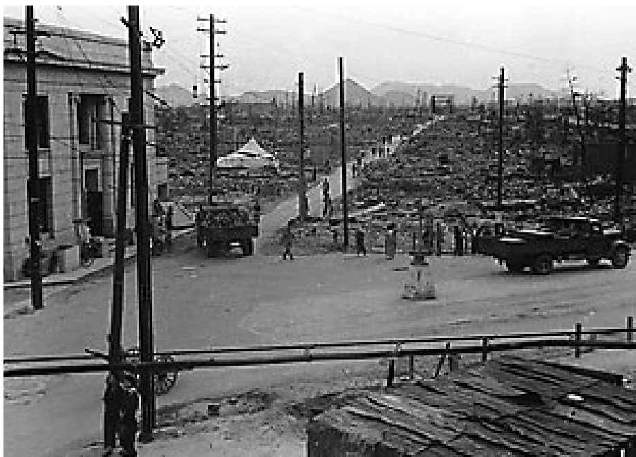
Southward view from Yokogawa Station, Hiroshima, Japan https://hpmuseum.jp/virtual/VirtualMuseum_e/exhibit_e/exh0802_e/exh080202_e.html

Finally, I don’t want the younger generations to experience such a disaster. However, it may happen again considering the present situation in which many countries possess nuclear weapons. I hope this may never happen again. Only those who were actually involved in the A-bombing really know the devastation caused by it. It’s horrific. Even though I condemn the A-bomb for the devastation it caused, people cannot really understand until they actually experience it. I think so. (The original interview was taken by the Seattle Hiroshima Club in 2010).