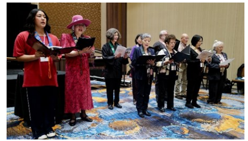
Singers from Seattle, White River, Tacoma, and Oregon BT at the Northwest District Convention