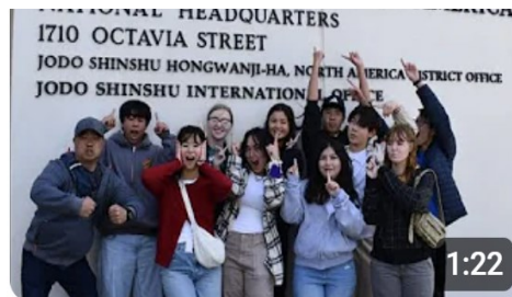
BYR (BCA YOUTH RETREAT) : PROMO VIDEO