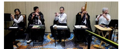
Gagaku musicians playing Etenraku