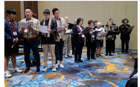
Northwest District singers at the Northwest District Convention singing with the gatha video of “Light of Wisdom”.