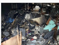
Arson Restoration Fund Established