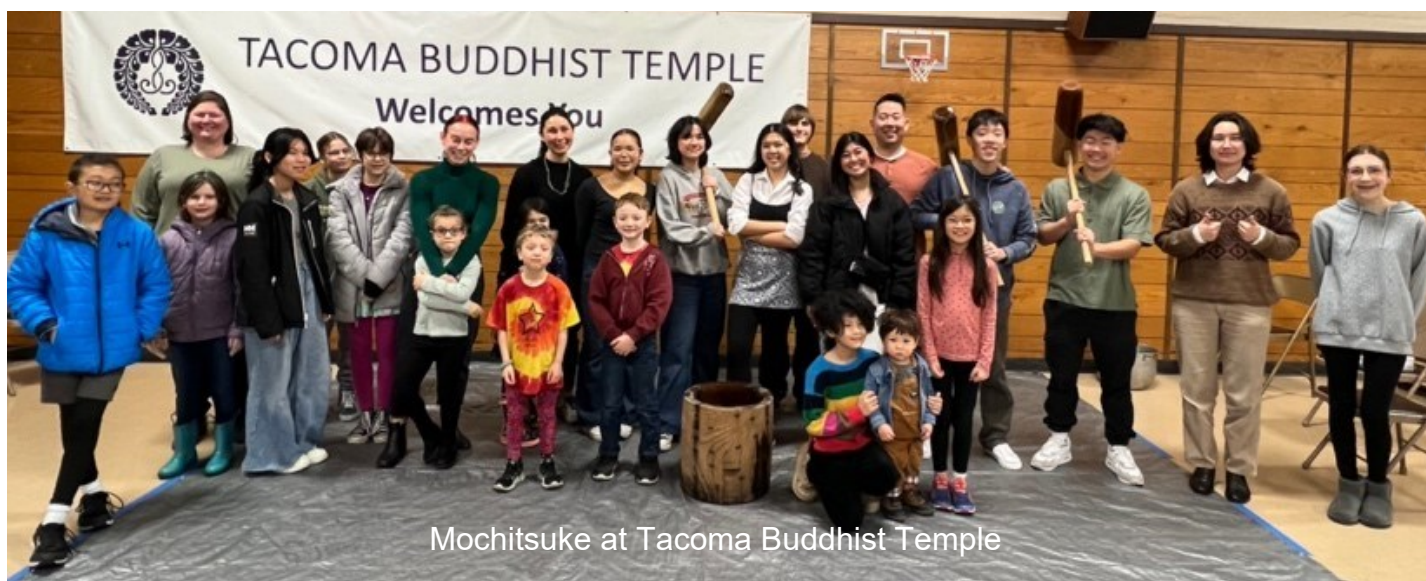
Mochitsuke at Tacoma Buddhist Temple