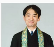
Gomonshu's New Year's Greeting