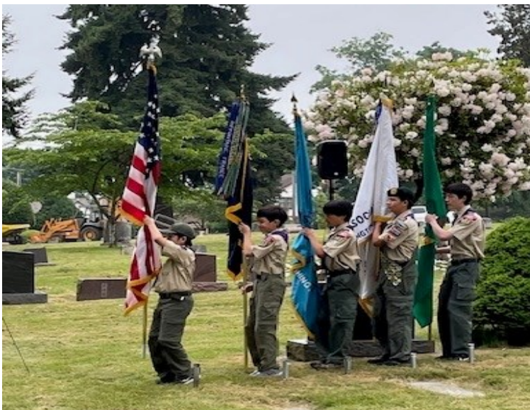
Troop 252 Color Guards – Lake View Cemetery for Nisei Veteran's Memorial Day Service