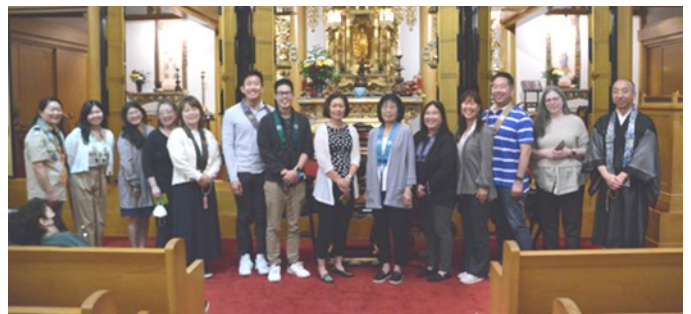
2022-23 Dharma School Teachers