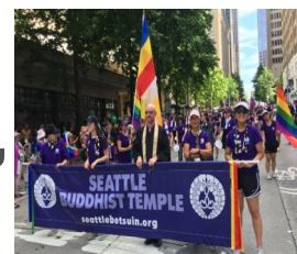
Seattle Betsuin at Pride Parade 2017