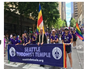
Seattle Betsuin at Pride Parade 2017