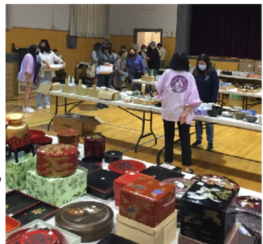
Opening Rush of Bachan's Closet