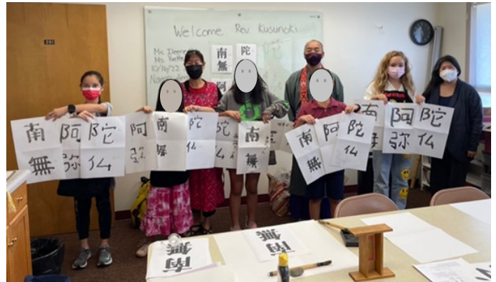
4 th /5 th grade students displaying calligraphy with teachers and Rimban

Our returning students, most who met each other on Zoom last year are now 4 th and 5 th graders! We got to know each other better (in-person) by playing BINGO after talking a bit about our summers and returning to school. Students were introduced to the reading of the year, "Our Pledge," which we will recite when we close class with gassho. It was fun to