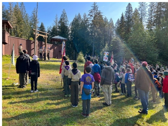
Camporee at Camp Edward

Troop 252 scouts attended Camporee at Camp Edward. The scouts participated in the Cast