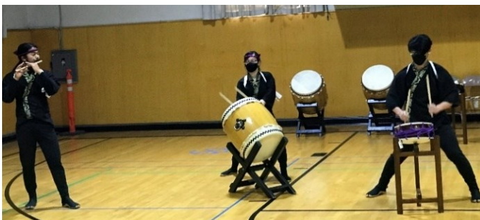
UW Taiko Kai performs on the last day of Dharma School