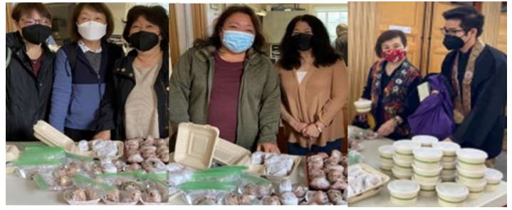
SBBWA members prepared and distributed sekihan and nigome after Gotanye Service on May 15, 2022.