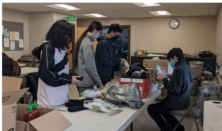
Jr. YBA and Dharma School sponsored a drive for food and personal items.