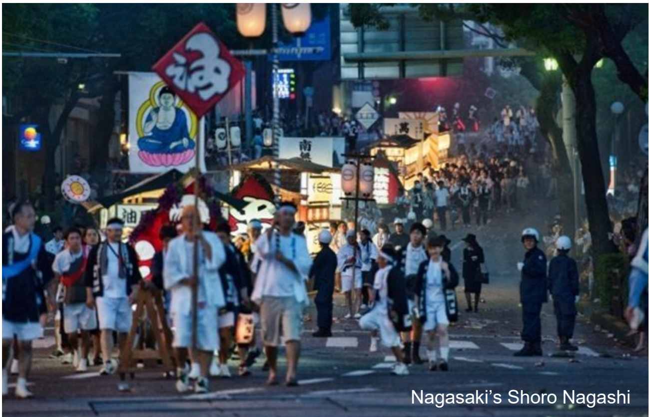
Nagasaki's Shoro Nagashi