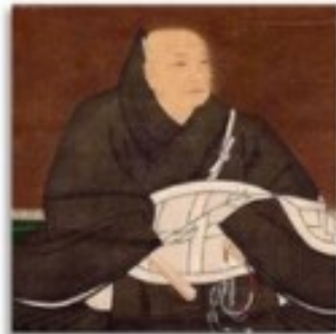
Rennyo Shonin (1415 - 1499)

Wisdom of a Great Propagator & Revitalizer