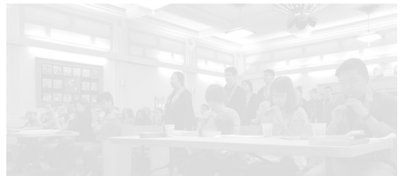
Seattle Betsuin Gagaku Group Gotan-E service May 19, 2019