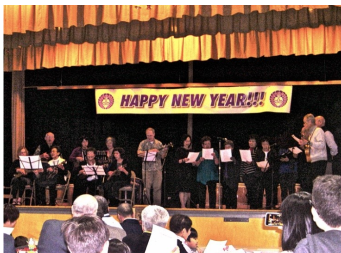
SBUB and Singers providing entertainment at the New Year's party