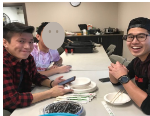
Kimpira making and lunching on January 5