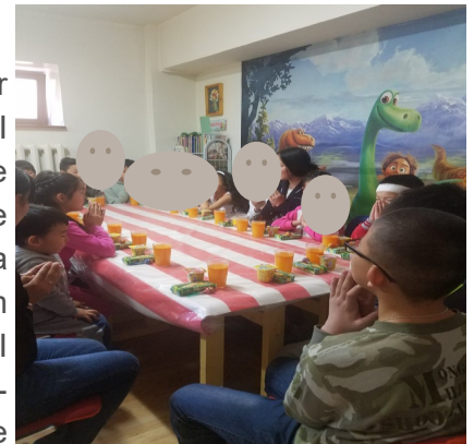
Children attending dharma lesson, having a snack

While there for nearly a month I stayed in a simple but comfortable dorm room with a shared bathroom and kitchen. I taught English every day. I could see how donated money is being used.