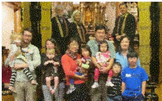
2012 Hatsumairi at Seattle Betsuin

The Hatsumairi ceremony will be held during the 10:00 a.m. Family Service on October 19, 2014. Although this ceremony identifies the presented as infants, children of all ages are welcome. If you would like to present your child(ren) at this joyous occasion, please complete the registration form below and return it to the Seattle Betsuin Buddhist Temple, 1427 S Main St, Seattle, WA 98144 or call the temple office by October 12, 2014 . A Dharma School representative will contact you with details. If you have any questions, please direct them to the temple office at (206) 329-0800 between 9:00 a.m. and 3:00 p.m.