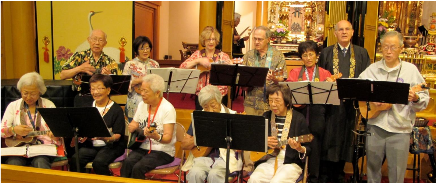
Ukelele band performing "We Are One" and "Sing" at Service August 17

Also this month, the Bodhi Ensemble will be featured for service music on September 21 for the Fall O-Higan and Eshinni-ko-Kakushinni-ko Memorial Service.