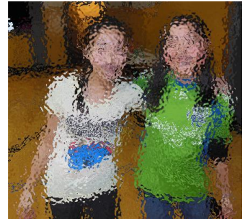
Jr YBA Retreat Photos

We discussed the Eightfold path and how it might be useful at the Olympics for both athletes and spectators. How Right Conduct, Right Speech, Right View basically most of them could all be used to create a wonderful event for everyone present. Then we made our own Olympic torch mosaic from paper. We celebrated girl's day by discussing the many traditions associated with it and making doll bookmark/magnets. We continued our Eightfold path discussion by reading the book Petey the Peanut Man about a guy trying to find his way to a job that would be the best fit, or Right Livelihood. Finally as we observed the Ohigan holiday we talked about the Dana Paramita and how we can give without having to use money, like smiles, hugs, or help. ###