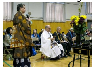
Hanamatsuri in Gym April 8 Sweet Tea Offering starts at 9:15