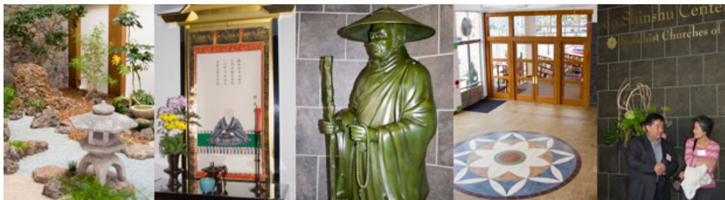
Jodo Shinshu Center