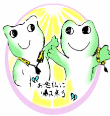
“ONEMBUTSU NI KAETTE KURU” COMING HOME TO THE NEMBUTSU...

Saturday and include Buddhist discussions, music, arts, and crafts. Childcare will be provided during workshop hours. Saturday night’s schedule includes a banquet and entertainment. Convention attendees will be responsible for making their own hotel accommodations with the DoubleTree at (206) 575-8220. Please be sure to mention that you are attending the NW Buddhist Convention when making your reservations to receive the discounted group rate. The final registration and room reservation date is January 24, 2008 . Questions regarding convention registration can be sent directly to the following e-mail address: convention-registration@seattlebetsuin.com . Don’t miss this last chance to register!